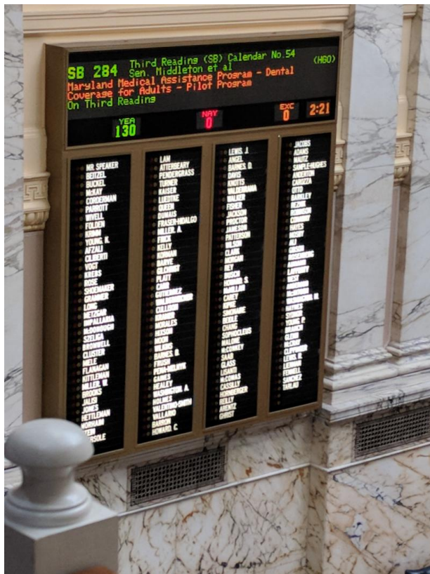
House Vote: Yea: 130; Nay: 0

Bill will establish a Medicaid adult dental coverage pilot program