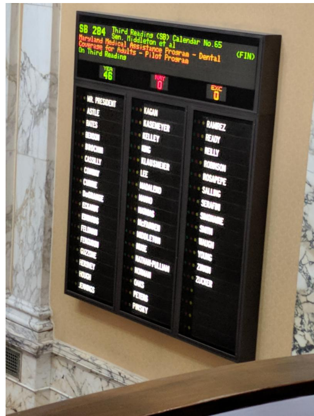
Senate Vote: Yea: 46; Nay: 0

On Saturday, April 7, the Maryland General Assembly unanimously passed SB 284 – Maryland Medical Assistance Program – Dental Coverage for Adults – Pilot Program . This is a huge victory and a giant step forward in demonstrating that a Medicaid adult dental benefit is a good investment in both health outcomes and the fiscal health of Medicaid, as it enables adults to establish a dental home, obtain preventive care, and avert costly dental conditions.