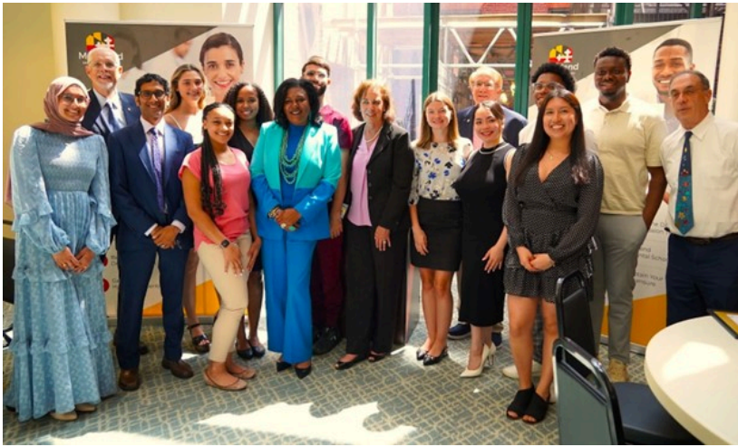
Dental Association Charitable and Educational Foundation.

During the event, the Maryland Department of Health, in collaboration with the Maryland Dental Action Coalition, and Maryland State Dental Association Foundation presented scholarships to high school and college students who aspire to pursue careers in dentistry. These scholarships will assist the students in covering their education tuition and program application fees.